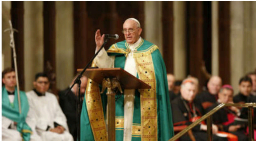
Pope Francis addresses St. Patrick's Cathedral in New York City.